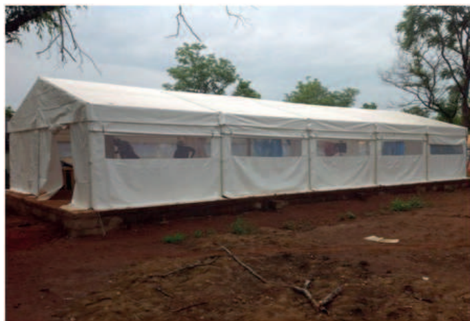
Multi Purpose Tent 6x12m